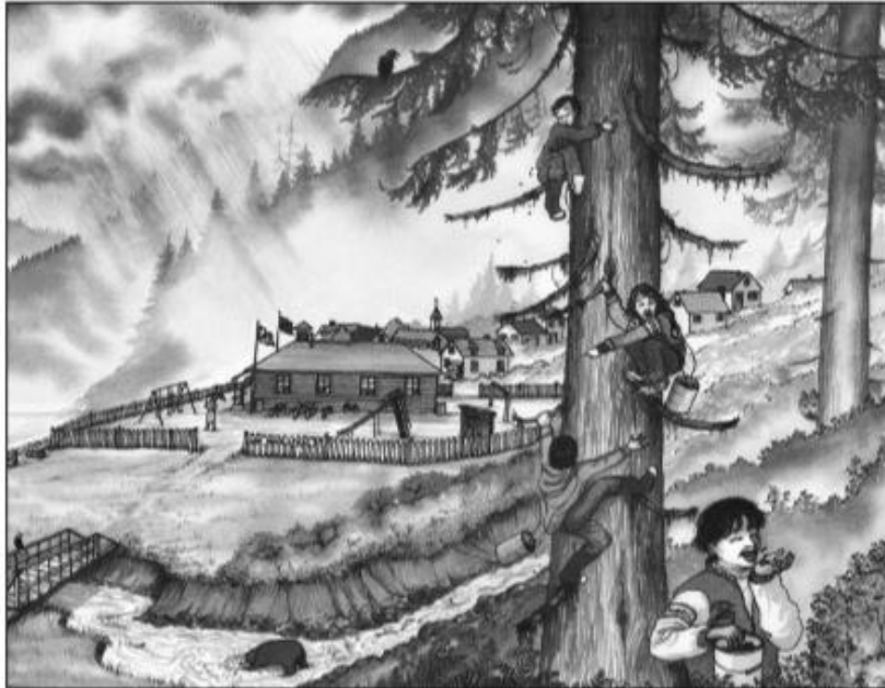
10. Back to School, from Tsimshian Seasonal Round: Potter Set (Ha'lilaxsimaay—September poster). Artist: Judy Hilgemann, FNES SD2